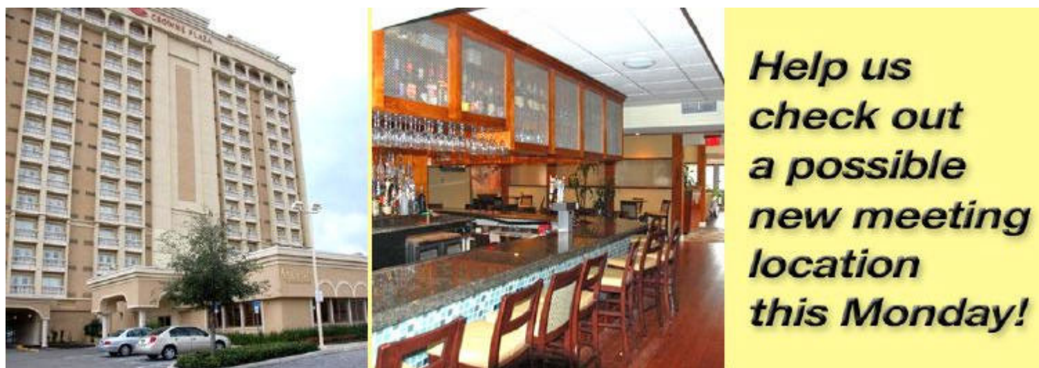
The Crowne Plaza downtown is a possible future site of 1066 meetings & Last Word

For the past six months we have been meeting at the UCF Building downtown, but not everyone has been enamored with the location, neighborhood, parking, meeting fee, or accessibility. Our new Board of Directors has been working to find a better venue, and this coming Monday, they invite you to check out one very attractive possibility during our next regular weekly meeting.