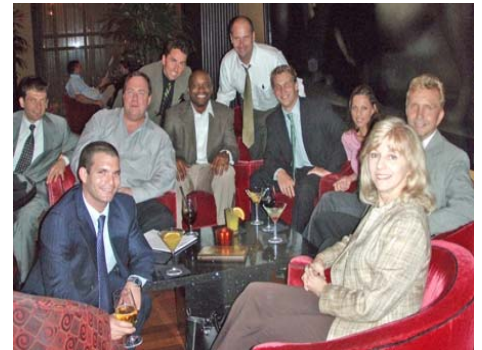
Conquerors enjoying libations and camaraderie at the “Last Word”